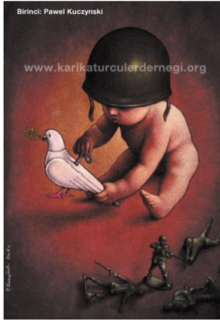
Figure 2. The caricature used for teaching semiotic analysis