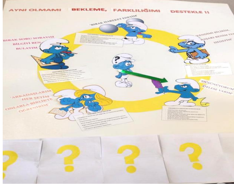
Figure 1. A poster example

Themes on the poster: learning styles, picture match, and instruction methods