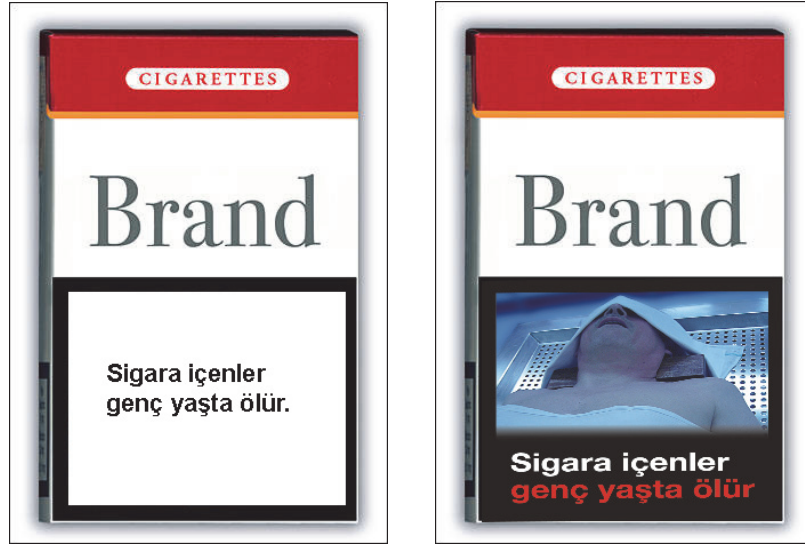
Example of Written Text Warning Example of Combined Warning

are present in cigarette smoke," "Smoking causes fatal lung cancer," "Smoking makes skin age earlier," "Smoking blocks blood vessels, and it causes heart attacks and paralysis," "Smokers die at a younger age," "Smoking causes painful and slow deaths." Figure 2 shows examples prepared for the A and B warning groups. Next, the packets were prepared for the A and B groups separately in the form of presentations. Having received the permissions required, the written text warning presentation for group A and the combined warning presentation for group B were given in the classrooms for 25 minutes each. The questions asked were answered in both groups before and after the presentations. At the end of the presentations, students' thoughts and feelings were obtained through a questionnaire distributed to them. The administration lasted approximately one class hour. The application of the research was performed between September 2014 and April 2015.