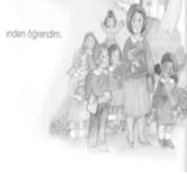
Figure 8. Occupations (Fourth Grade)

Physical appearances were examined in the primary school Turkish textbooks in terms of weight, hair color, and hairstyle, skin color for females; and hair color, hair length, and skin color for males. Females and males were depicted mainly as slim with the exception of a few overweight females and males. Females in the first, second, third and fourth grade Turkish textbooks had black, brown, red or yellow hair. Their hair was depicted with a knob, double or single pony tails. Haircuts were usually pageboy style; and short hair was rare. Females were depicted with normal height and weight. Very few overweight people were included, and they were old people. Females in the pictures were mostly light skinned. Males' hair was mostly neither very short nor very long in the first, second, third and fourth grade textbooks. The hair colors were black, brown, white, and red. Males were depicted as light skinned with a shaven beard. There were also bald and bearded men. Examples of pictures are given below in Figure 9-10.